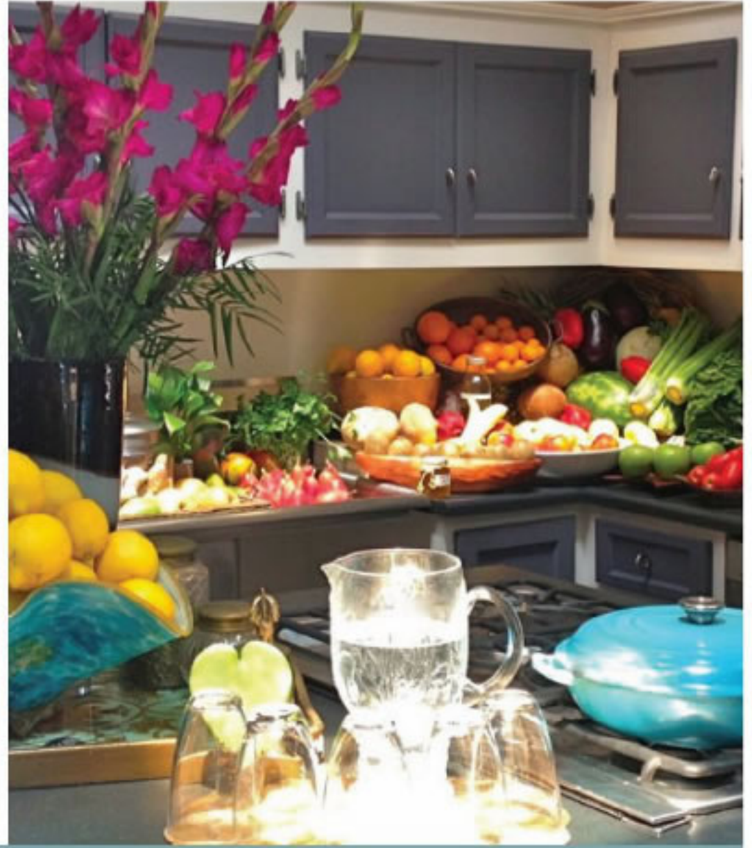
CLOCKWISE FROM TOP LEFT: Herbs from the vertical garden; organic bounty for a day's meal; the cozy living room for fireside chats; the property's relaxation pool.